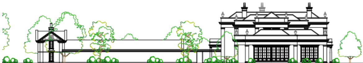
south-east elevation 1:100