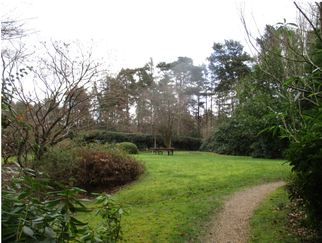
View towards Sunningdale Golf Course