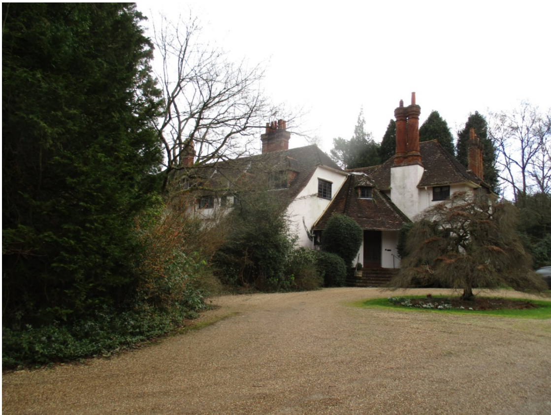
View of application property.