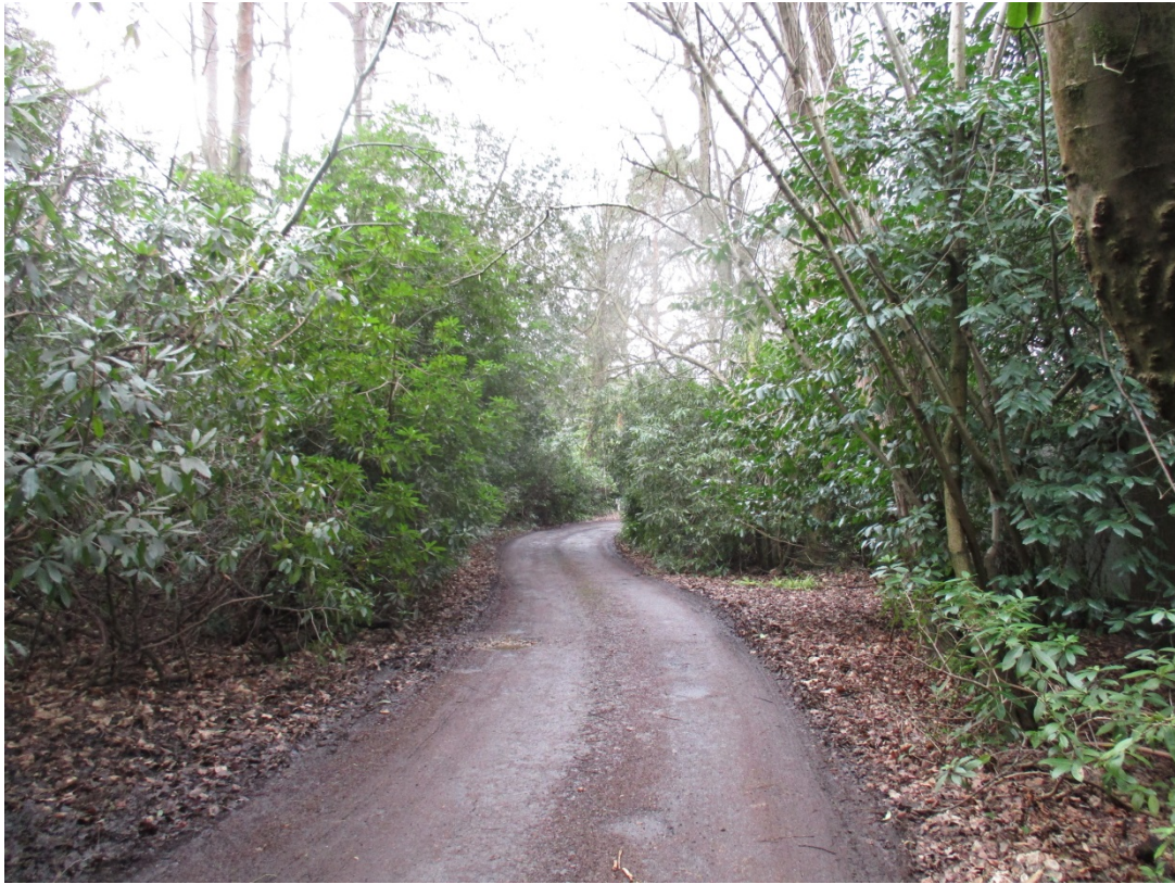
View along site access

15/0934 – WOODHALL, WOODHALL LANE, SUINNINGDALE